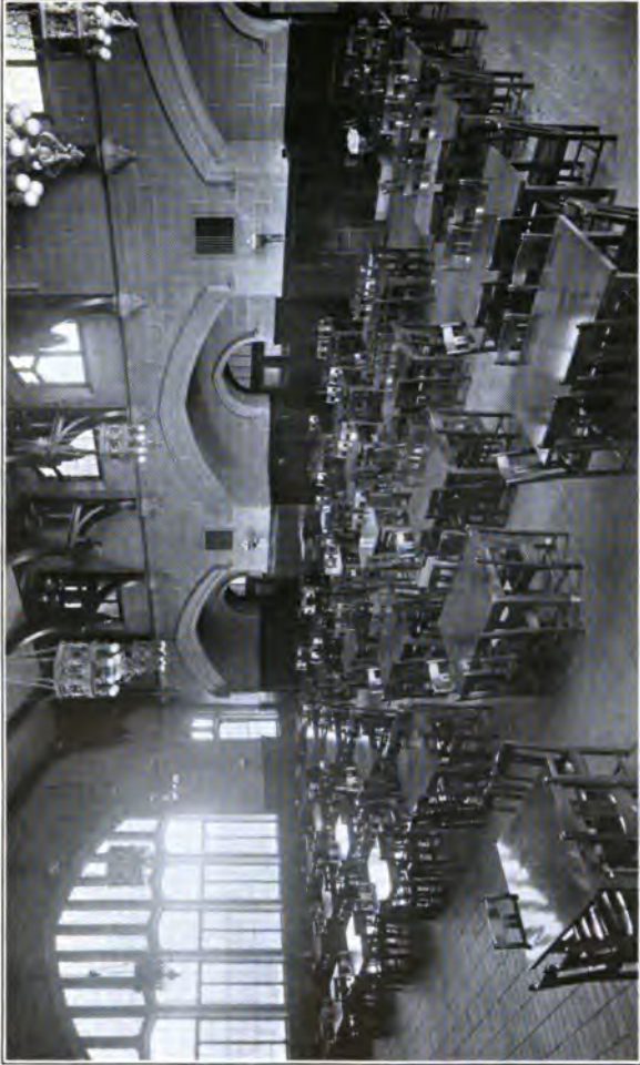
Scott High School lunchroom in Toledo. This beautiful room might well be used for study before and after lunch periods